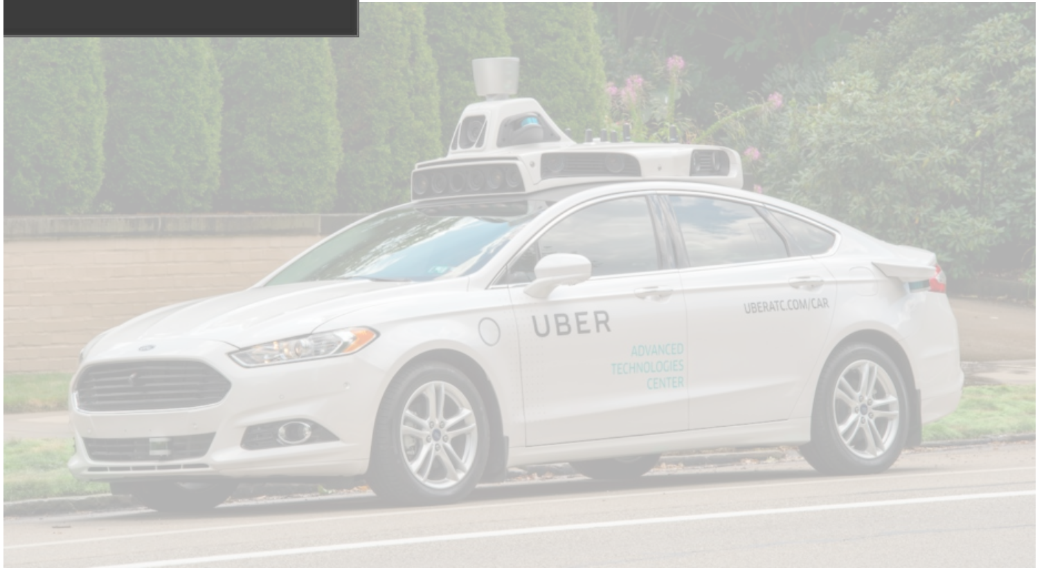
Above: Uber's new self-driving car

Uber has paid an undisclosed sum to purchase a mysterious New York-based company that it will use to launch a new research unit.