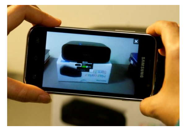
Figure 7: Displaying status of the recognized speaker

speaker. Users can choose to adjust the volume slider or turn the speaker on or off.