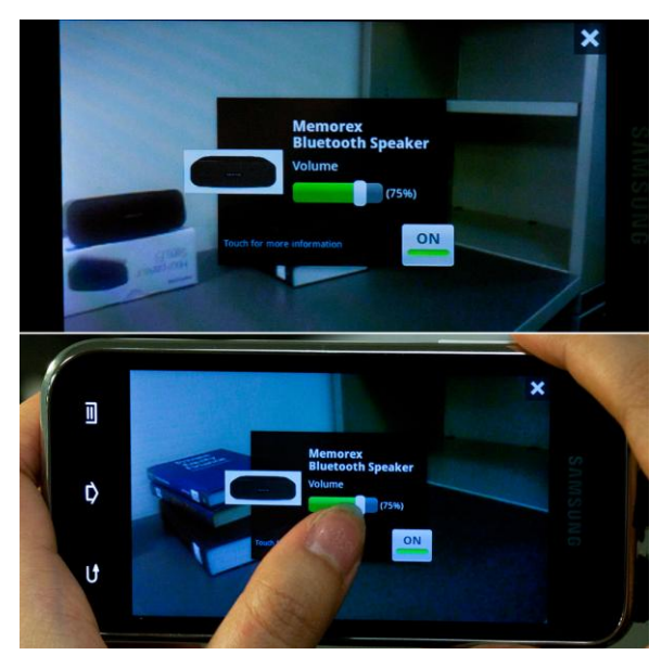
Figure 9: 2D overlay to better operate devices