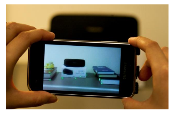
Figure 6: Scanning mode: trying to recognize the registered device

After the target devices have been registered, users can switch to scanning mode where the AR application tries to scan for the registered devices by matching the images in memory with the live streaming from the camera (Figure 6). A current limitation of Vuforia is to allow only five different devices to be recognized simultaneously.