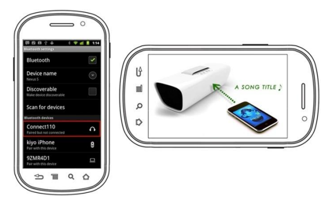
Figure 1: Traditional menu-based interface (left) and AR with visualization (right)

In figure 1, the menu-based interface may cause difficulty for users to identify the mobile device by only looking at its name. On the other hand, the visualization presents intuitively which the mobile device is currently transmitting music to the speaker, and what song is being played. Hence, the AR visualization is useful especially when there are many devices surround which causes difficulty for users to identify the communication between the devices. And this visualization of the communication between devices is a feature we propose in this prototype.