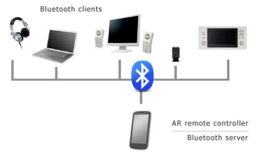
Figure 3: Network architecture

Our Android AR application on the Galaxy Player serves as the Bluetooth server and is able to send and receive data from the Bluetooth speaker and the laptop. To synchronize music and adjust the volume of the Bluetooth speaker, we only need to pair the Galaxy Player with the speaker, as the firmware on the speaker would be able to control it. However, in order to control the laptop such as controlling the mouse or adjusting its volume, it is necessary to install a small program on the laptop to receive and execute commands via Bluetooth. Currently, we have been able to send commands from the Android device to the laptop, but have not explored all the possibility of how to control the laptop. For the workshop demonstration, users will be able to remotely control both the speaker and the laptop.