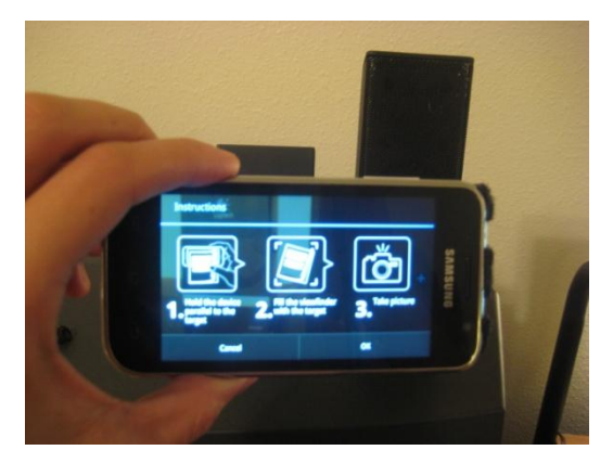
Figure 4: Registering our Bluetooth speaker

To increase the amount of details and therefore improve the device recognition rate, we could add a simple colored tag as the AR marker on each of the device. However, the prototype is intended for an office or laboratory setup where the light condition is sufficiently consistent; therefore we chose to implement this marker-less approach in which the devices are recognized and tracked by their registered images. Unfortunately, how Vuforia image recognition engine works specifically is a black-box to us because it is not open-source.