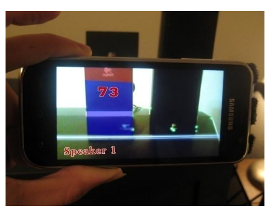
Figure 8: Visualization Overlays Actual Device

For better operating a device, beside the 3D overlay interface superimposed on the recognized device, we also provide users with the options to switch to a 2D interface when the device is afar and appears too small on the screen to interact with the controls on the 3D overlay. When the recognized device is not in the view, the 2D interface still allows the user to operate the device. In figure 9, the user is adjusting the volume when the speaker is not in the view anymore.