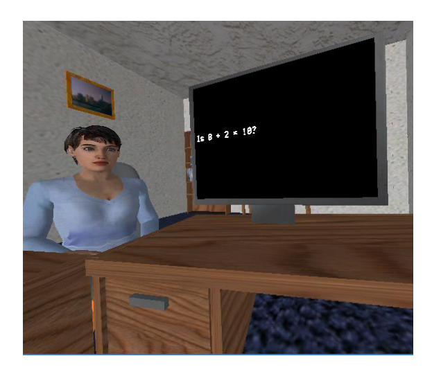
Figure 3b. Participant view of virtual audience in the Virtual Human Immersive condition