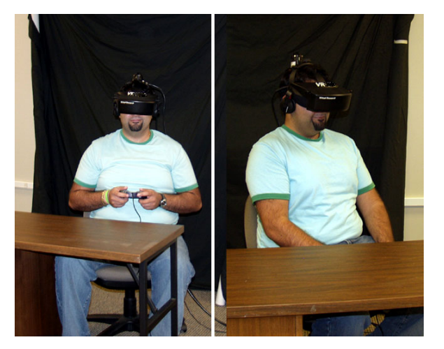
Figure 3a. Participant in the Virtual Human Immersive condition.