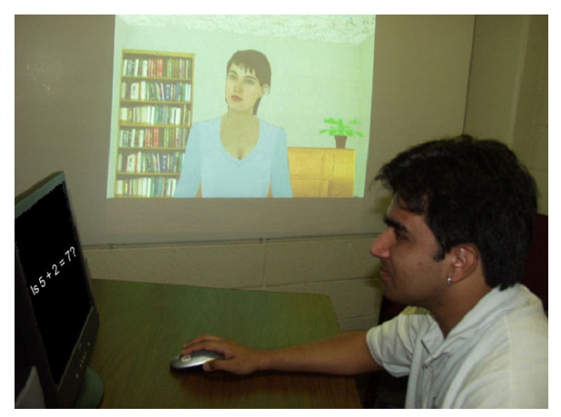
Figure 1. Participant with virtual audience.

coughing, sniffling, yawning, looking around, clearing throat, and shifting in her chair. In addition, Diana displays life-like behaviors such as breathing, blinking, and other subtle gestures. Two speakers at the bottom of the projection screen were used to output the various sounds from Diana (coughing, sniffing, etc.).