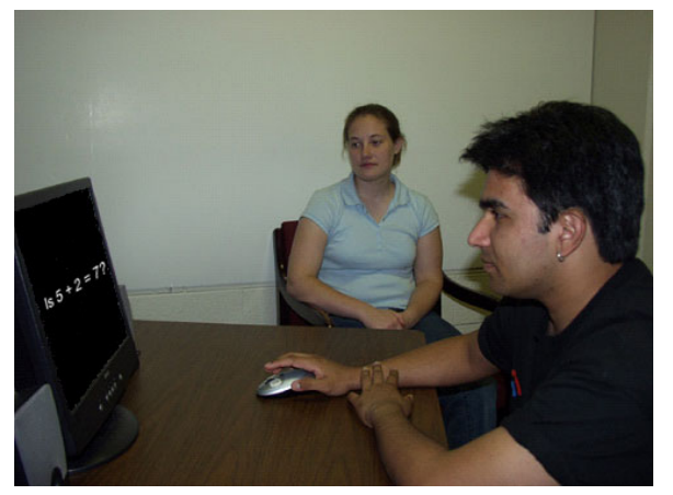
Figure 2. Participant with real audience.